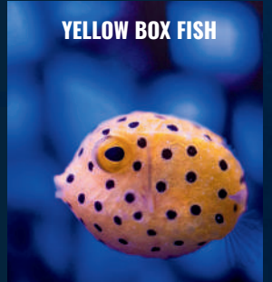
YELLOW BOX FISH