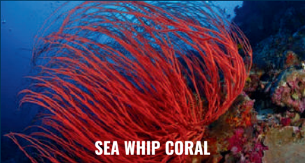
SEA WHIP CORAL