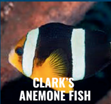
CLARK'S ANEMONE FISH