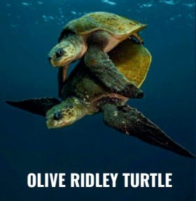
OLIVE RIDLEY TURTLE