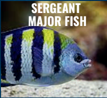
SERGEANT MAJOR FISH