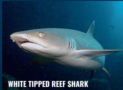
WHITE TIPPED REEF SHARK